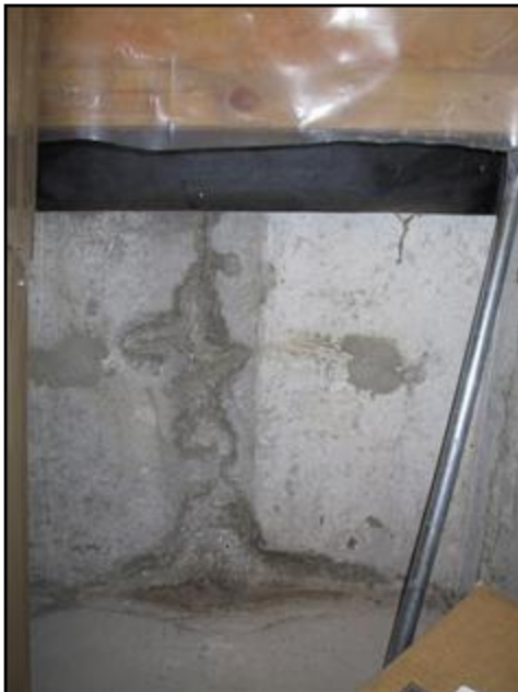
1. East wall

Note: Both cracks were wet to the touch.