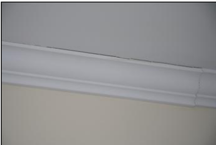
4. Living room crown moulding - east wall