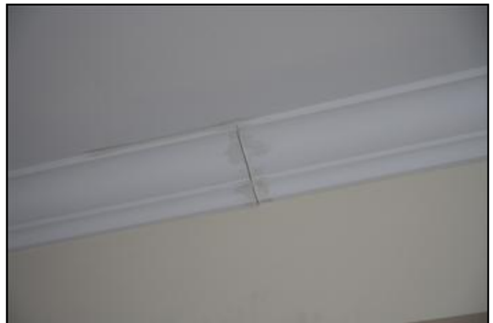
5. Living room crown moulding - west wall