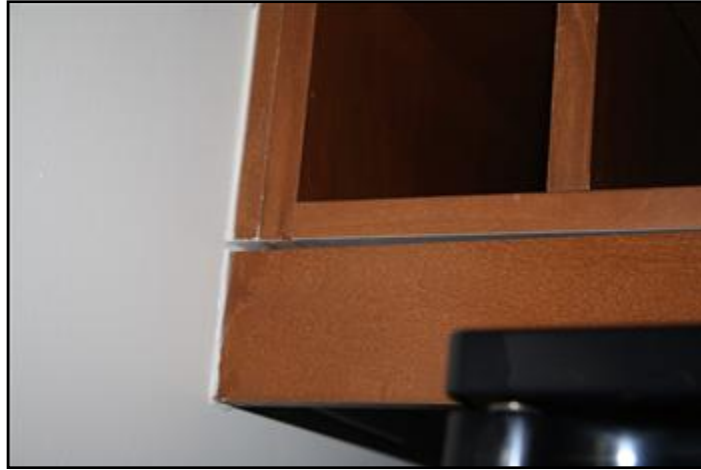
6. Upper cabinet trim