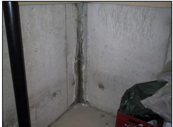
2. Northeast corner